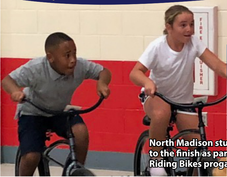
North Madison students race to the finish as part of the Kids Riding Bikes program in PE class