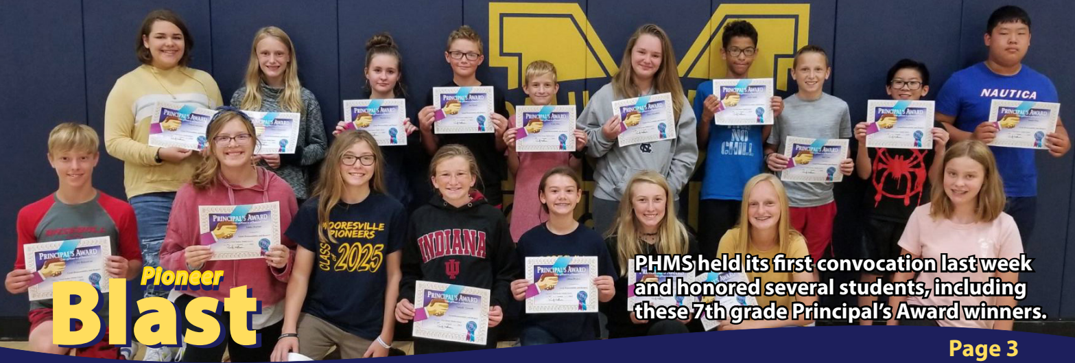
PHMS held its first convocation last week and honored several students, including these 7th grade Principal's Award winners.