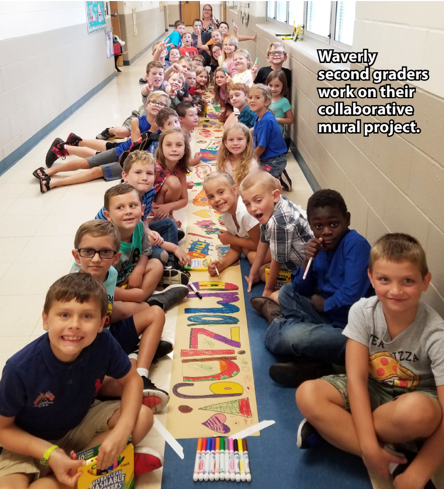
Waverly second graders work on their collaborative mural project.