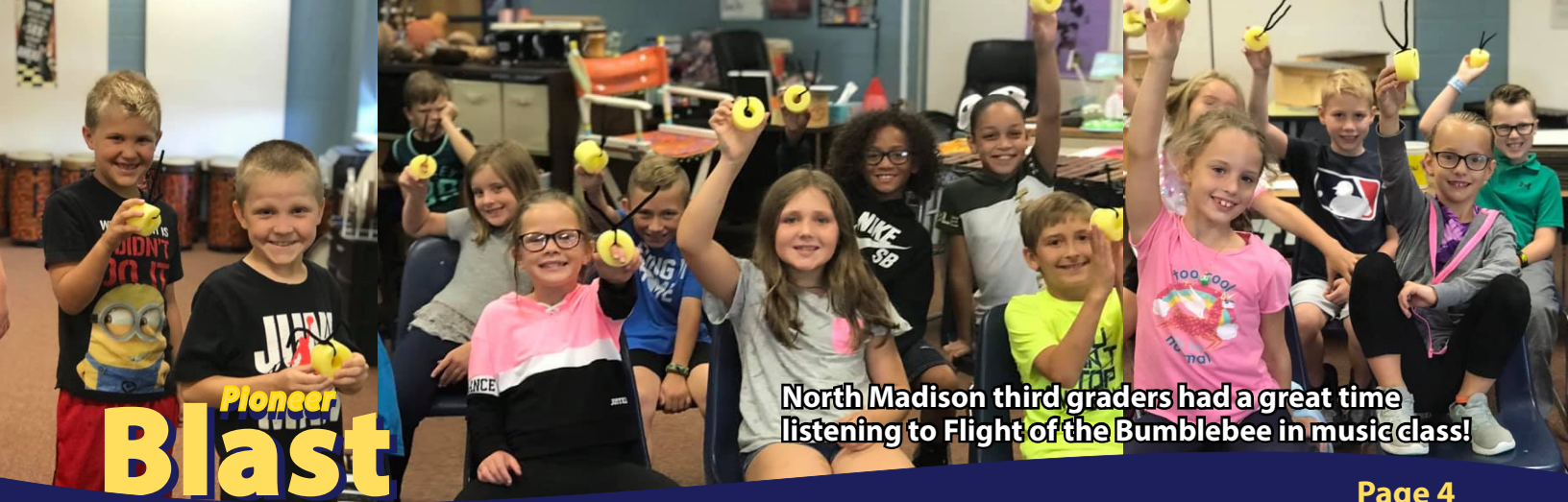
North Madison third graders had a great time listening to Flight of the Bumblebee in music class!